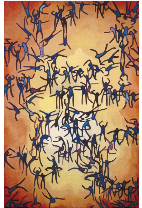
Figure 1 It’s a small world: social networks have small average path lengths between connections and show a large degree of clustering. Painting by Idahlia Stanley.

partners, k_{\text{tot}} in the respondent’s life up to the time of the survey. This value is not relevant to the instantaneous structure of the network, but may help to elucidate the mechanisms responsible for the distribution of number of partners. Figure 2b shows the cumulative distribution, P(k_{\text{tot}}) : for k_{\text{tot}} > 20 , the data follow a straight line in a double-logarithmic plot, which is consistent with a power-law dependence in the tails of the distribution.